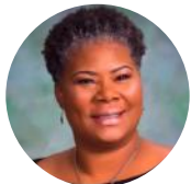
COMMISSIONER HON. YVONNE KINSTON