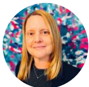
COMMISSIONER CAROLINE LEDLIE