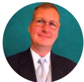
COMMISSIONER HON. TIM RADFORD