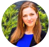
COMMISSIONER AMBER SMITH